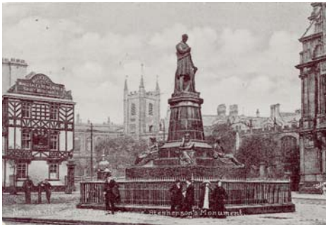
Stephenson Memorial, (George) Westgate Road, Newcastle by John Graham Lough (1798-1876)

In April 1859 Lough's plaster model was exhibited in the nearby Literary and Philisophical Society before it was sent down to London to be cast in Bronze. On 3rd October 1862 the monument was inaugurated at an elaborate ceremony attended, so it was claimed, by over 100,000 spectators.