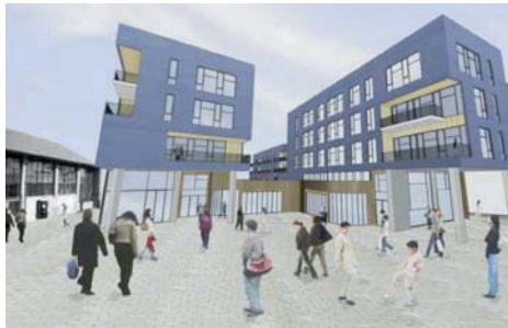
Proposed Stephenson Square with the Western side of Stephenson Works seen on the left of the drawing.

Edinburgh based firm Malcolm Fraser, Architects are engaged on the design of the proposed Stephenson Quarter redevelopment and have produced a number of images of how the development will look.